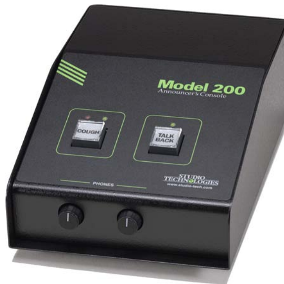
Model 200 front panel shown with buttons labeled for on-air applications

The Model 200 is optimized to directly interface into the broadcast environments typically used for events such as football, baseball, basketball, and motor sports. Standard connectors are used for the microphone, headphone, talkback, and IFB signals. This allows setup to be fast and consistent. A limited number of configuration options are provided. Once selected, no event-to-event configuration changes should be required. For ease of use, the on-air talent is presented with a simple set of controls and indicators. Whether it's mic preamplifier, audio switching, talkback output, or headphone cue feed, excellent audio performance is maintained throughout.