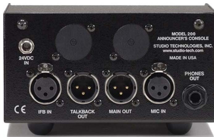
Model 200 back panel

In the world of broadcast audio it's fair to say that applications vary widely. To this end, one or two additional XLR-type connectors can be easily mounted into the Model 200's back panel. Seven 3-position "headers" are located on the Model 200's circuit board and provide technician-access to all input and output connections. Using a factory-available interface cable kit, these allow a Model 200 to be optimized to meet the exact needs of specific applications. For example, some applications may prefer to use a multi-pin XLR-type connector to interface with a headset. This could be easily accomplished by adding the appropriate 5-, 6-, or 7-pin XLR-type connector and making a few simple connections. Other applications may benefit from having "mult" or "loop-through" connections, something easily incorporated into a Model 200. One or two optional line-input cards, as previously discussed, can also be mounted in the spare XLR positions.