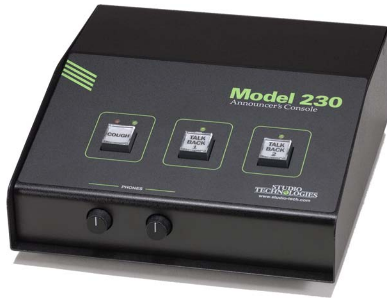
Model 230 front panel shown with buttons labeled for on-air applications

A truly next-generation product, extensive research into the needs and desires of field production personnel was integral to the Model 230's creation. Providing a veritable "tool kit" of features, the unit supports a wide variety of applications that include on-air television and radio broadcasting, stadium announcement, and simultaneous interpretation. In addition, with the unit's broad range of capabilities many other specialized "behind-the-scenes" applications can also be implemented.