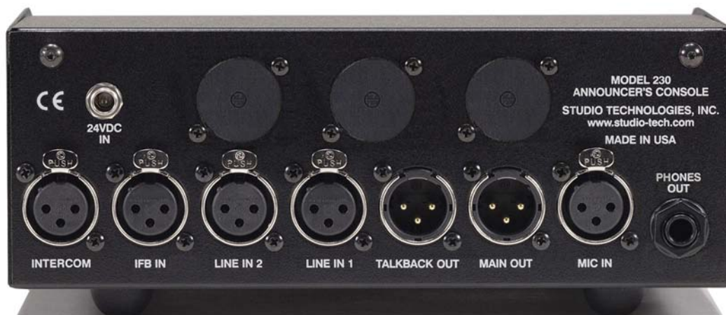
Model 230 back panel

The Model 230 is just one in a series of announcer console products available from Studio Technologies. The Model 230 was designed to support a variety of applications where a wide range of features and flexibility is required. For applications whose requirements are more limited in scope, the other products in the 200-series should be reviewed. Complete information is available on the Studio Technologies website.